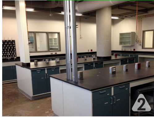
LAB 2 803 Sq Ft