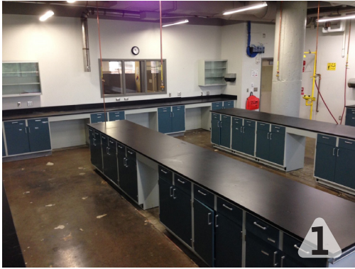
LAB 1 912 Sq Ft