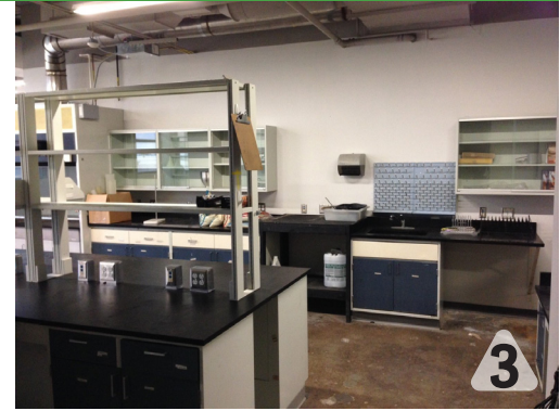
LAB 3 643 Sq Ft